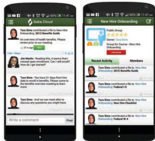
Access Communities and Discussions